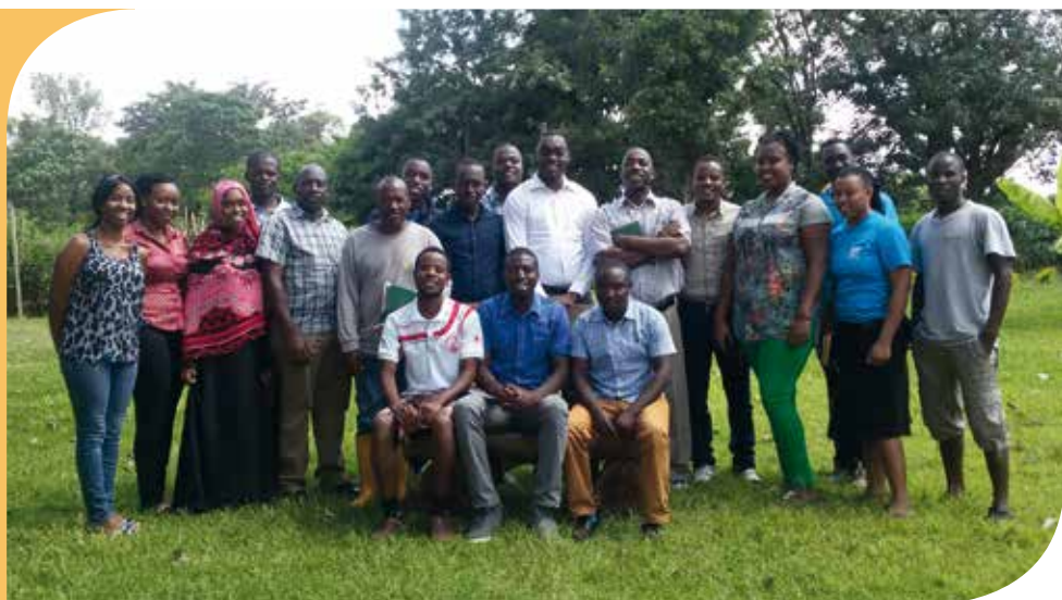
The Sevia team